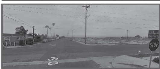
D Street Looking West