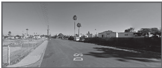
D Street Looking East